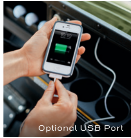
Optional USB Port